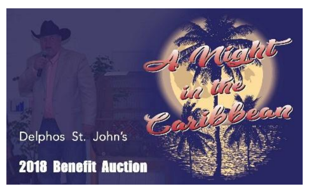
2018 BENEFIT AUCTION – A NIGHT IN THE CARIBBEAN Saturday April 28th, 2018, DSJ All Saints Building

Come join us as we spend "A Night in the Caribbean". Doors will open at 5:30 p.m. with dinner being served from 6:00 to 7:30 p.m. and Raffles starting at 7:30 p.m. Tickets are $75.00 per couple which includes dinner and your Reverse Raffle number. The First Place Cash prize winner will take home $5,000.00 and Second Place receiving $1,500.00. Over 100 Oral, Silent and Chinese Auction items will be available to bid on. Please contact the Ministry Center @ 419-695-4050 for more information and to purchase a ticket.